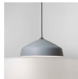
CODE: 1361004 FINISH: LIGHT GREY