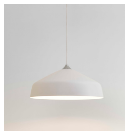
CODE: 1361012 FINISH: MATT WHITE

TO MAINTAIN THIS PRODUCT TO ITS BEST CONDITION, PLEASE VIEW OUR CARE AND CLEANING GUIDE ON THE SUPPORT SECTION OF THE ASTRO WEBSITE.