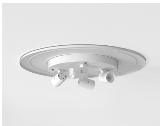
CODE: 1462003 FINISH: MATT WHITE

TO MAINTAIN THIS PRODUCT TO ITS BEST CONDITION, PLEASE VIEW OUR CARE AND CLEANING GUIDE ON THE SUPPORT SECTION OF THE ASTRO WEBSITE.