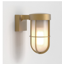
Code: 1368008 Finish: Antique Brass