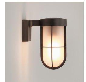
CODE: 1368026 FINISH: Bronze

To maintain this product to its best condition, please view our care and cleaning guide on the support section of the astro website.