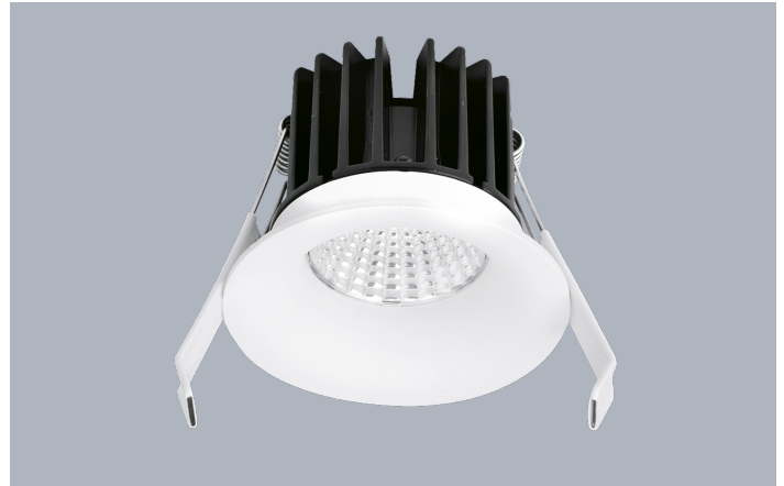
CurveE™ 7W Baffled Dimmable IP44 LED Downlight