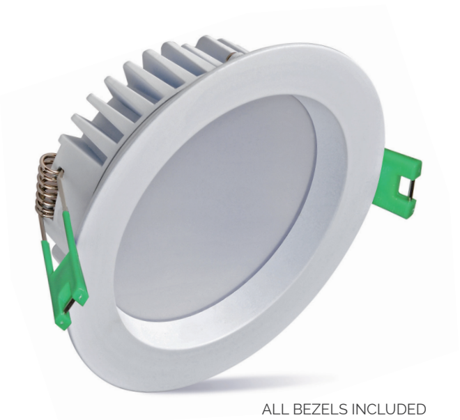
ALL BEZELS INCLUDED